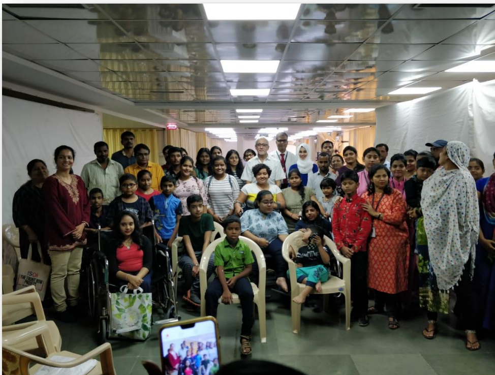
PARTICIPANTS AND THE ASSESSMENT TEAM

The event was concluded at 4pm. All the patients who participated in the event were duly informed about the dates and time of follow up. The session concluded with a vote of thanks to all participants.