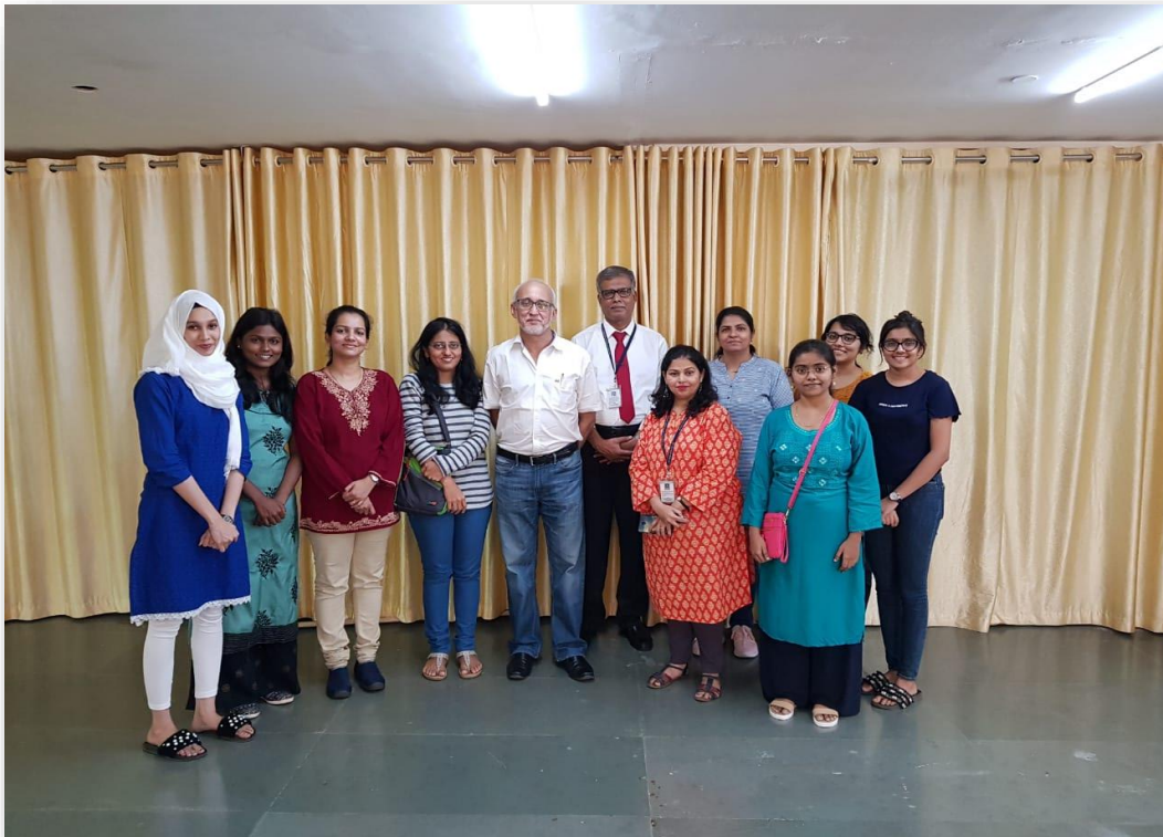
TEAM INVOLVED IN FOLLOWUP

The follow up sessions were held on 18 & 21 Dec at Lilavati hospital. During follow up detailed discussion took place regarding the assessment of various tests performed during the 8 th Dec programme and further advice was given to patients depending on the results of the various assessments.